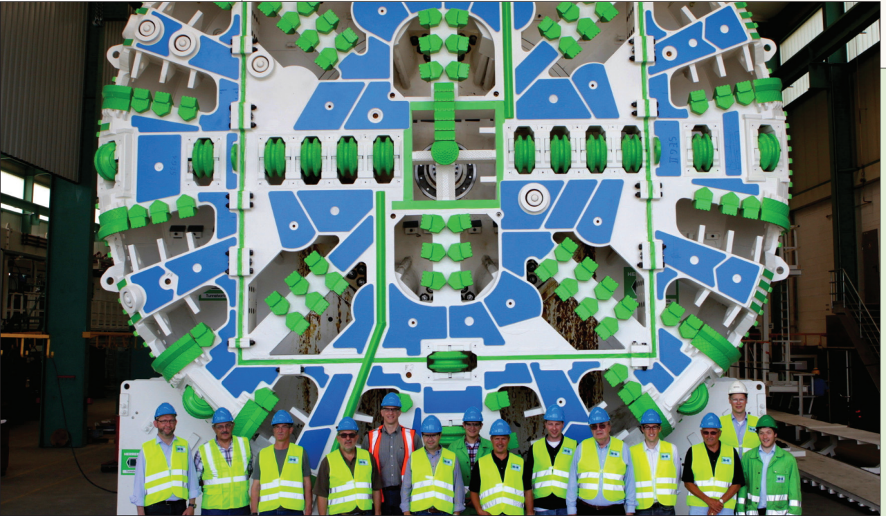
The massive tunnel boring machine, with a view of the head that will eat through dirt and rock, more than 100 feet deep.