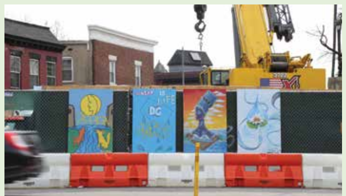
A custom-designed fence wrapping with paintings from Howard University artists