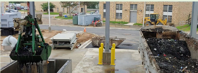
The tunnel terminates at Blue Plains Advanced Wastewater Treatment Plant where a massive clam bucket removes debris.

Since being put in service three years ago, DC Water's Anacostia River Tunnel Phase 1 has captured more than 10 billion gallons of combined sewage that would have overflowed into the Anacostia River. Additionally, the tunnel captured and removed over 4900 tons of trash, debris and other solids, preventing them from littering the Anacostia and its downstream neighbors—the Potomac and Chesapeake Bay.