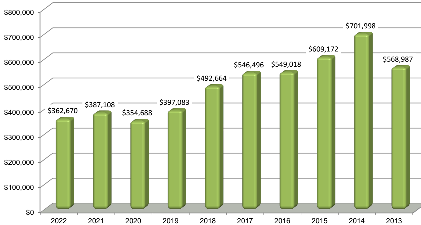
EXHIBIT 3 CAPITAL DISBURSEMENTS LAST TEN FISCAL YEARS ($000)

Note: These disbursements include DC Water's share of Washington Aqueduct's capital disbursements.