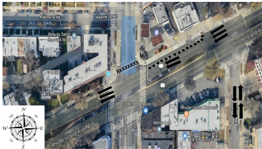
Map of the travel restrictions on the 400-block of Rhode Island Avenue, NE

Westbound Rhode Island Avenue, NE traffic will merge left around the 4th Street, NE construction and then return to three-lane travel immediately past the intersection.