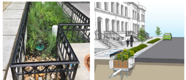
Planter Bioretention (PBR)

Also known as a rain garden, bioretention captures and cleans stormwater runoff allowing it to infiltrate into the ground and slowly releases any excess runoff into the combined sewer system.