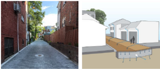
Alley Permeable Pavement (APP), also known as green alley

Permeable Pavement allows stormwater runoff to infiltrate through the pavement and into the ground and slowly releases any excess runoff into the combined sewer system.