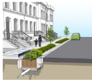
Planter Bioretention (PBR)